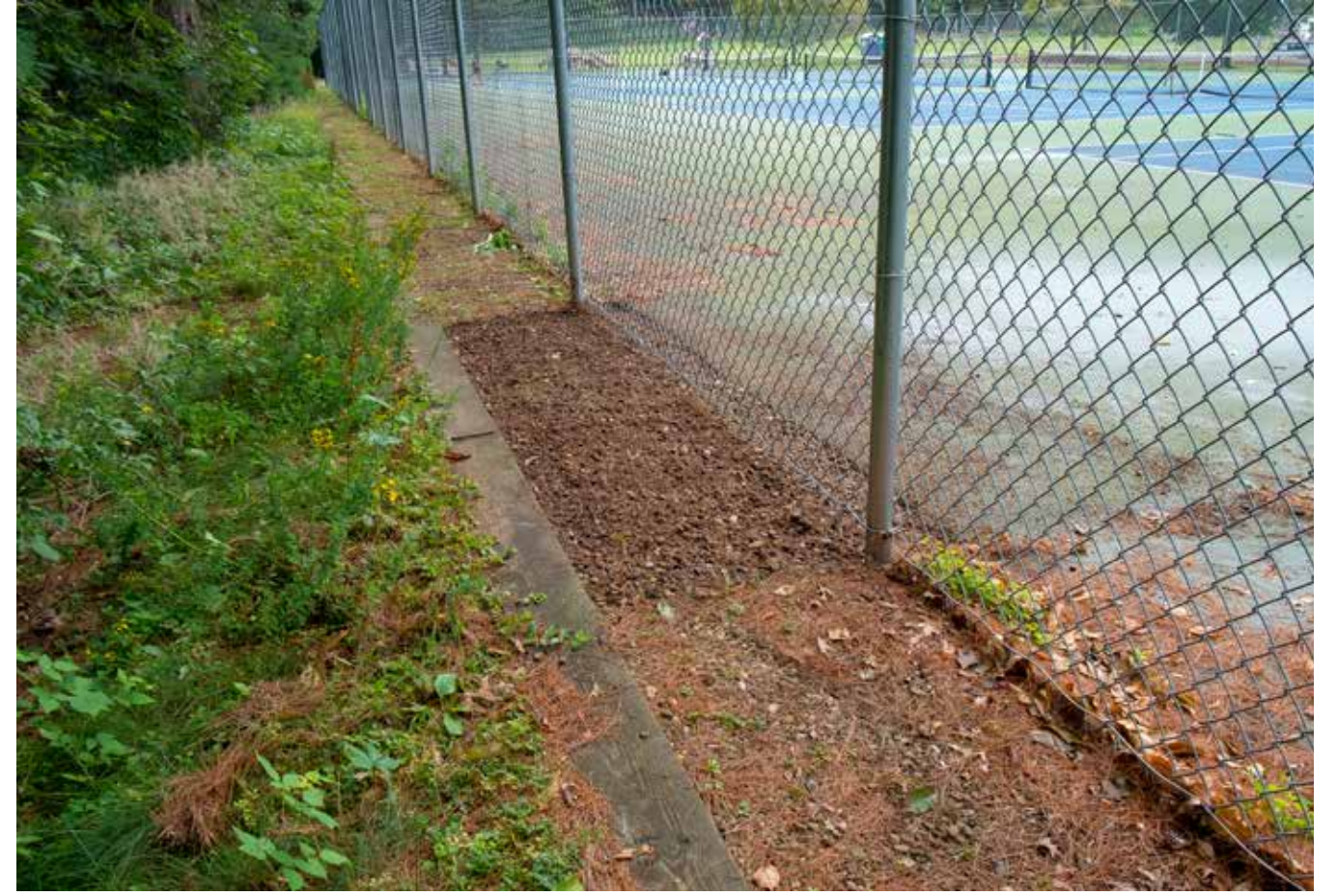
Tennis courts, Avon 2016