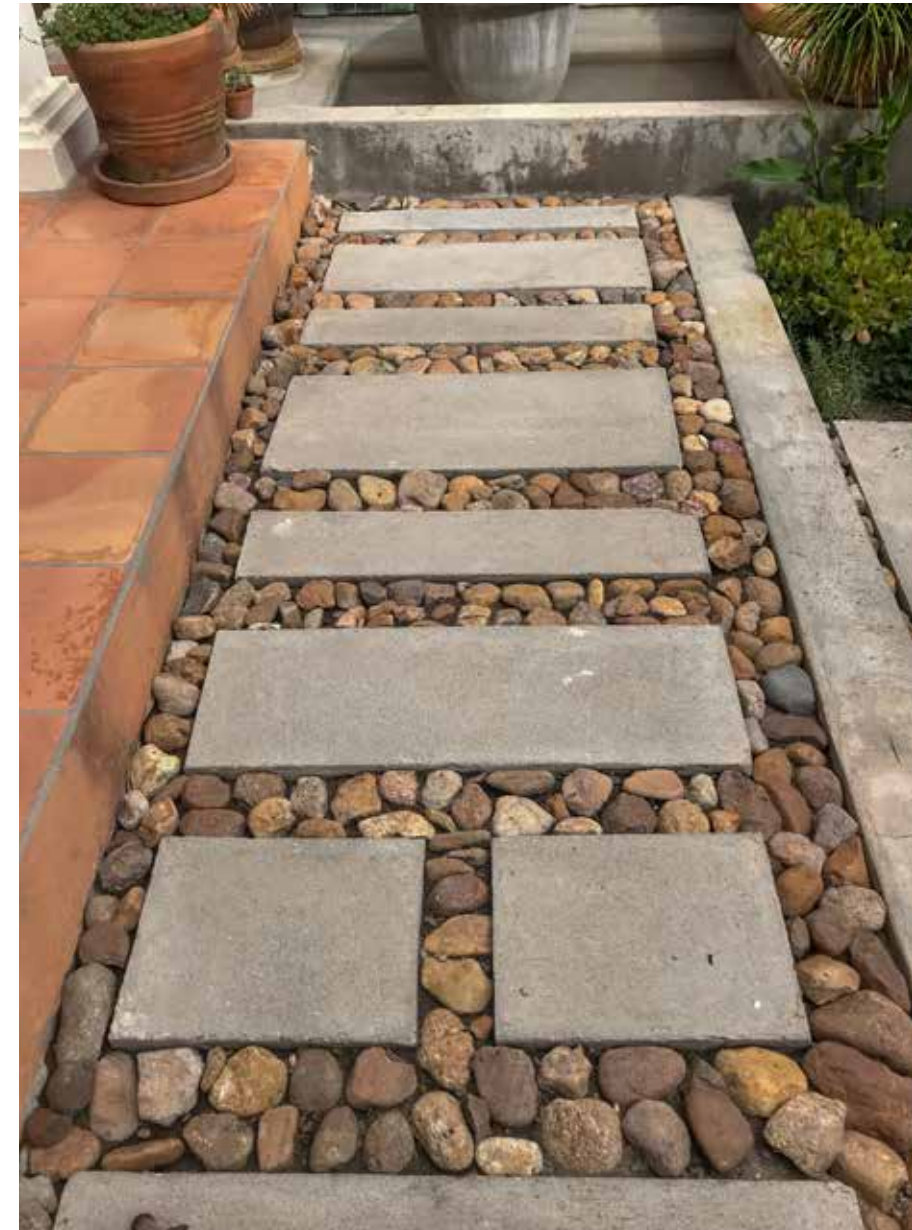
San Miguel de Allende, Mexico 2019