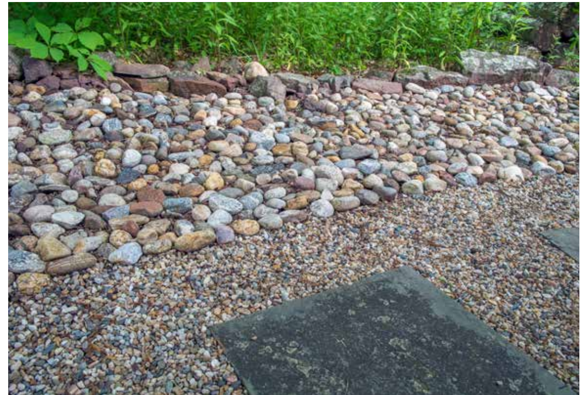
Avon Mountain 2015