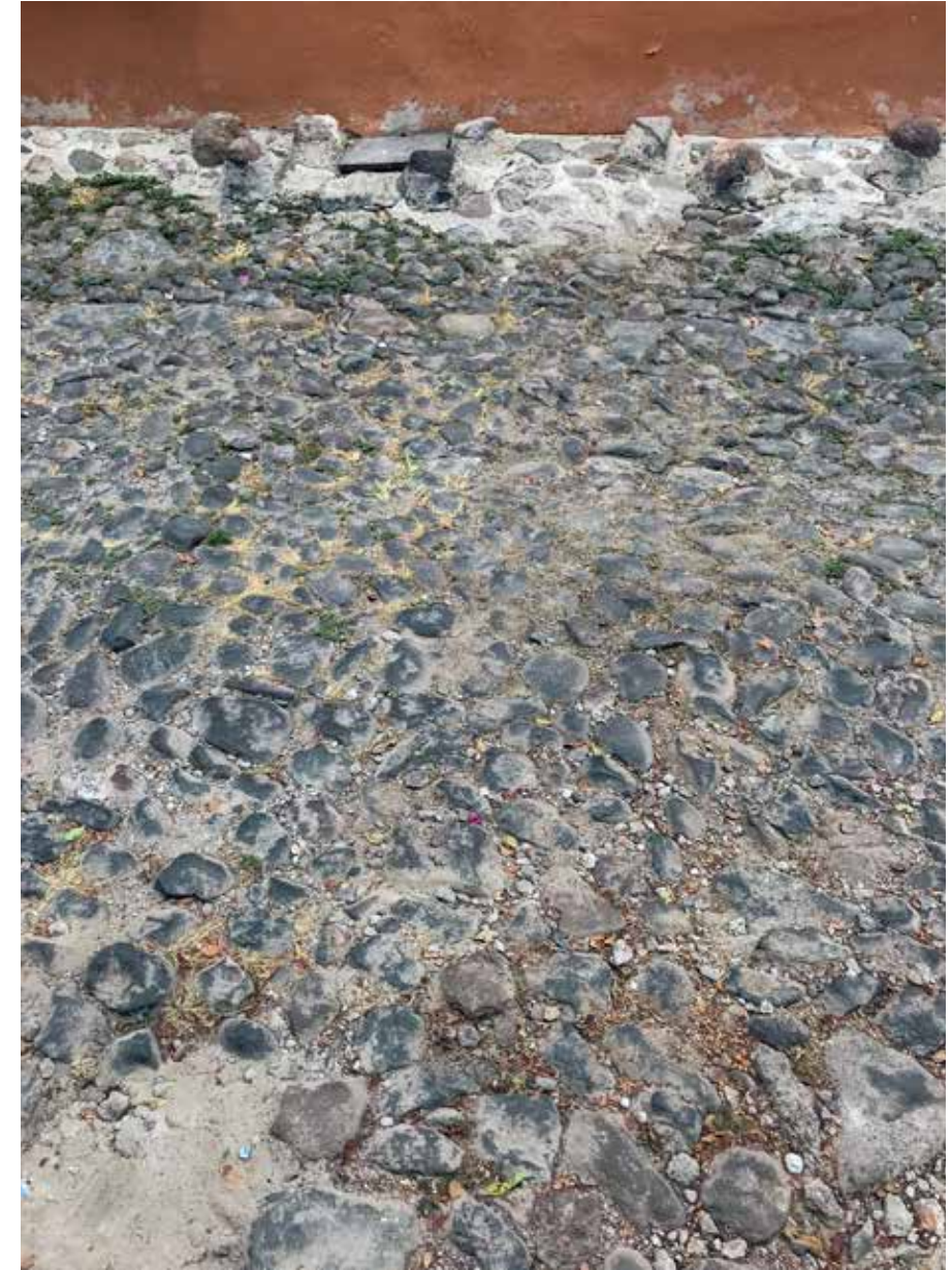
Calle del Callejon, San Miguel de Allende, Mexico 2019