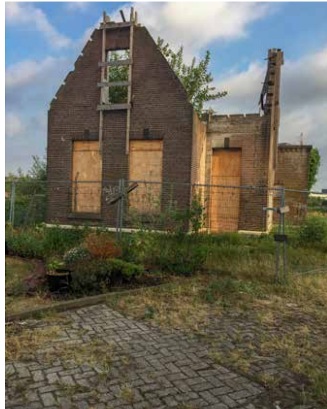
Haarlem, The Netherlands 2018