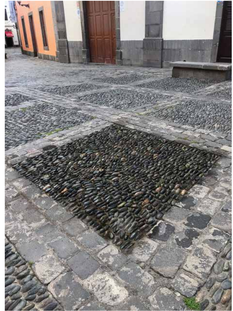
Plaza de San Antonio Abad, Las Palmas, Gran Canaria 2020