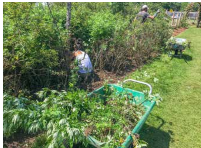
Elizabeth Park Rose Garden, Hartford, CT