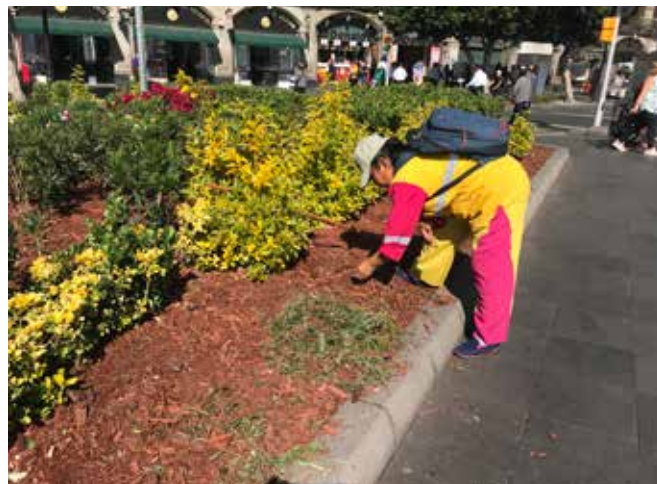
Centro Ciudad de Mexico, Mexico

Try to pull the entire weed out not just the top, or it will regenerate. The roots are easier to pull out when the soil is moist. Always keep a tool for weeding and a bucket handy.