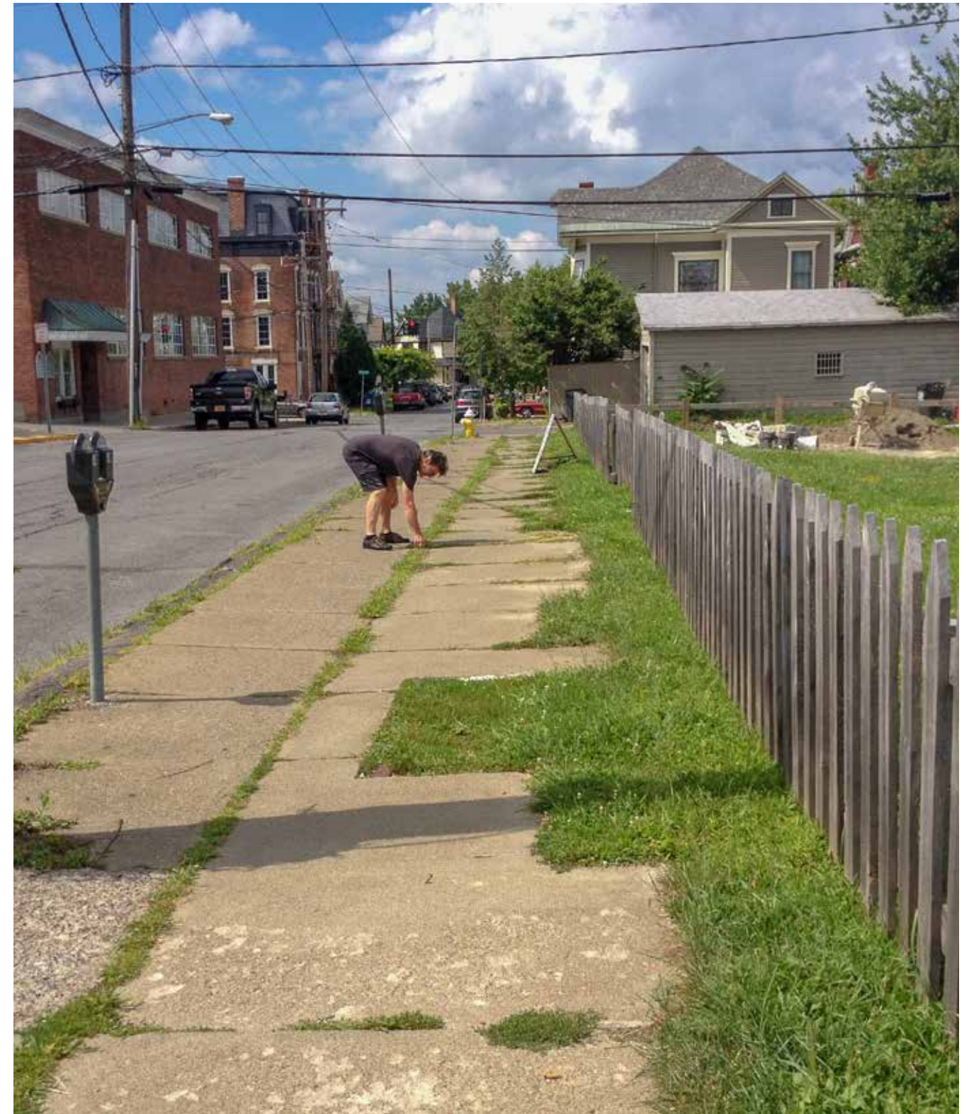
Hudson, New York - 2012