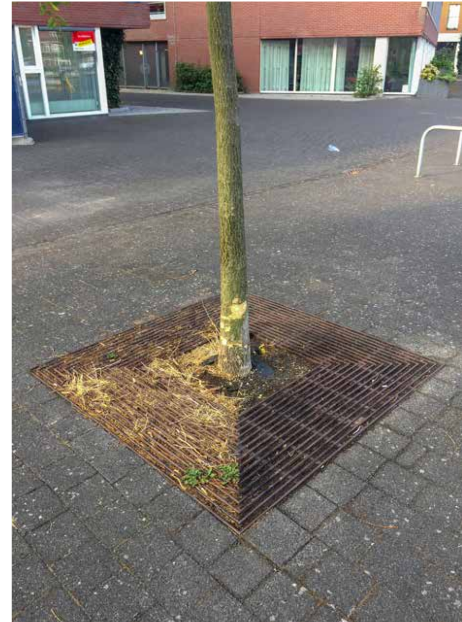
Haarlem, The Netherlands 2018