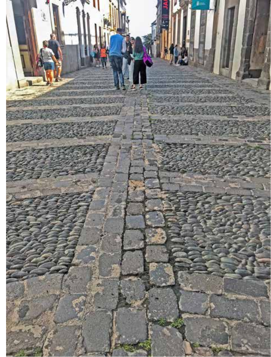
Los Balcones, Las Palmas, Gran Canaria, Canary Isles 2020