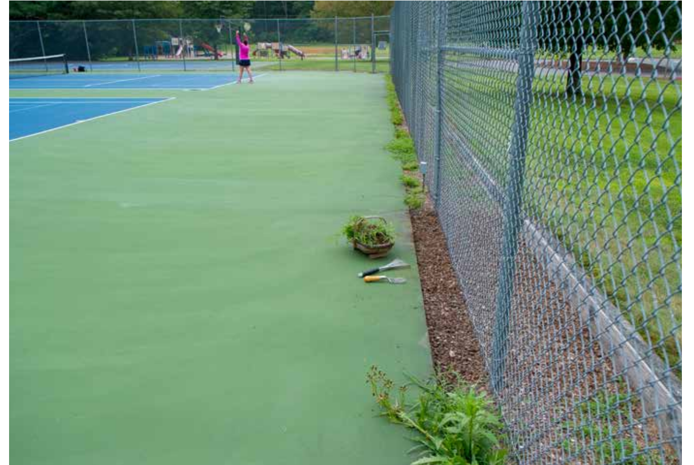
Tennis courts, Avon 2016